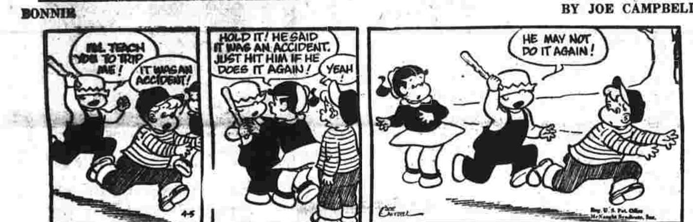
BY JOE CAMPBELL