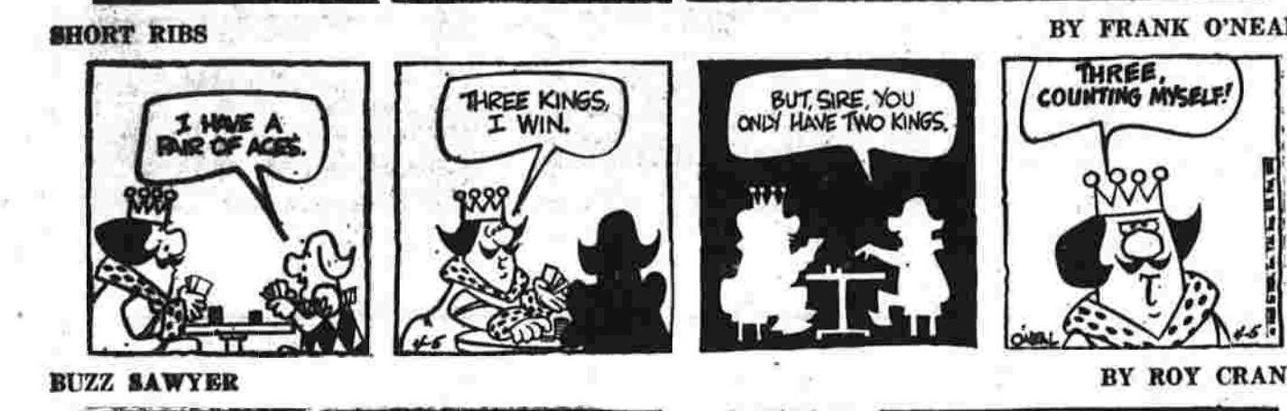
BY FRANK O'NEAL